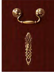
Drawer/Door Pulls Antique Brass