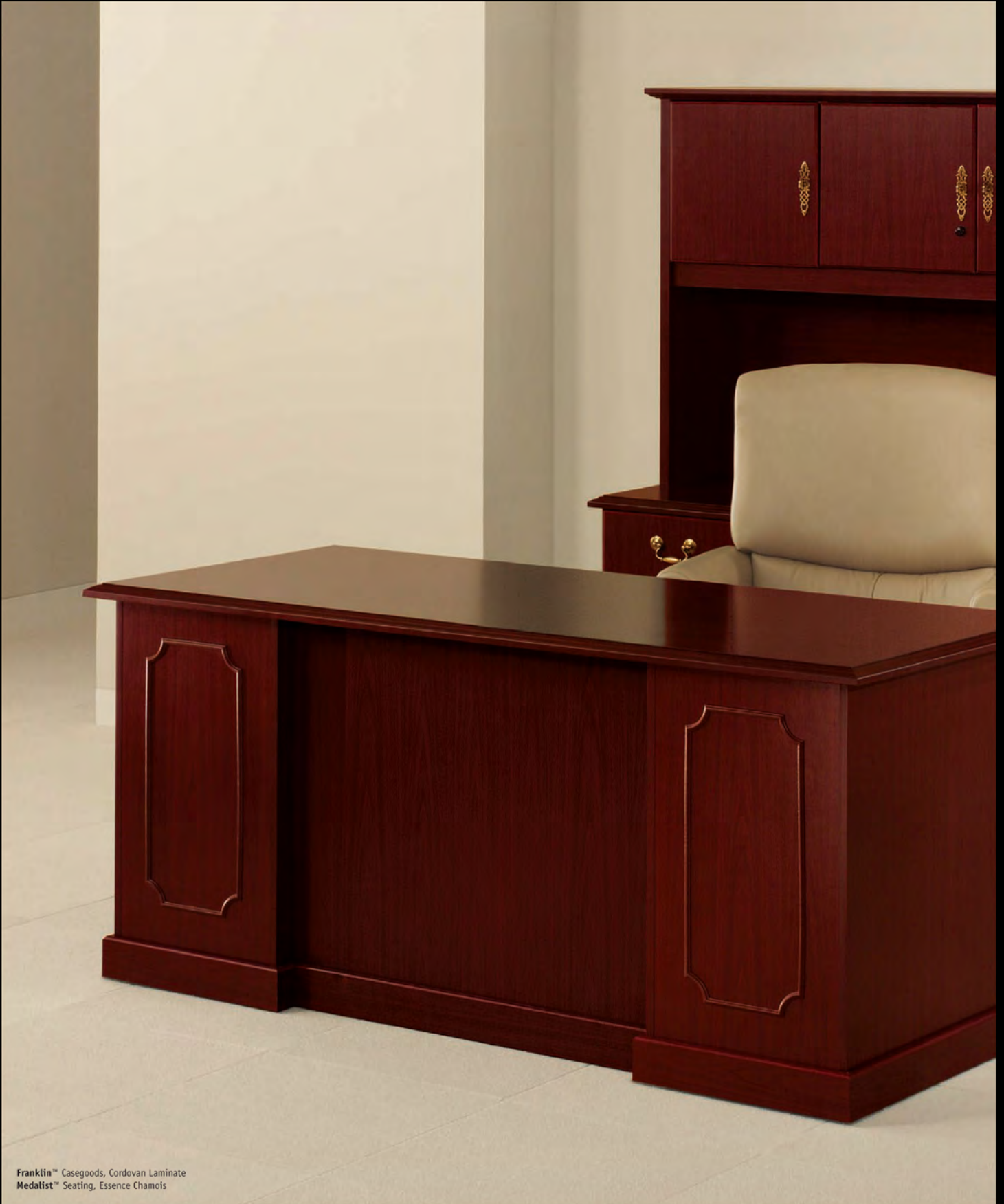
Franklin™ Casegoods, Cordovan Laminate Medalist™ Seating, Essence Chamois