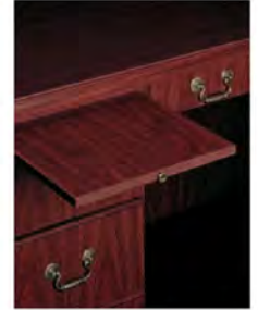
Dictation Slide On Desks

Please reference the National™ Price List or our website at www.NationalOfficeFurniture.com for additional product information.