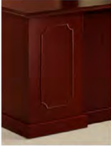
Picture Frame Molding