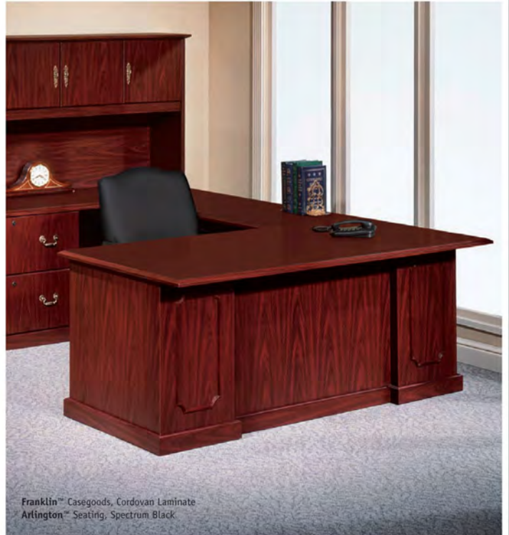
Franklin™ Casegoods, Cordovan Laminate Arlington™ Seating, Spectrum Black