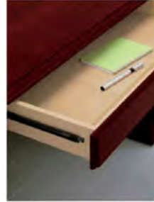
Center Drawer On Desks