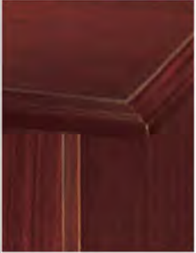
Mitered Rim Profile